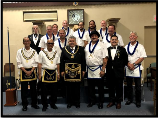
Pictured above are the 2019 officers of Kona Lodge with the Installing Team with Grand Lodge Officers.

MASONIC CENTER 75-5577 KAUHOLA ST. #7 KAILUA KONA, HI 96740