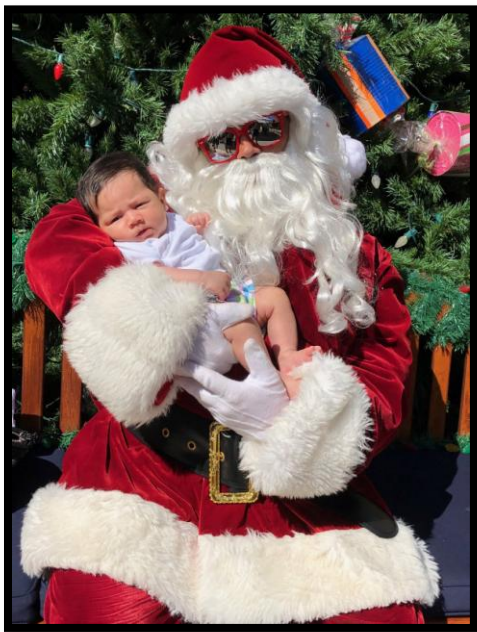
Baby's first Christmas