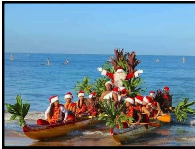
Santa Clause is coming to town!