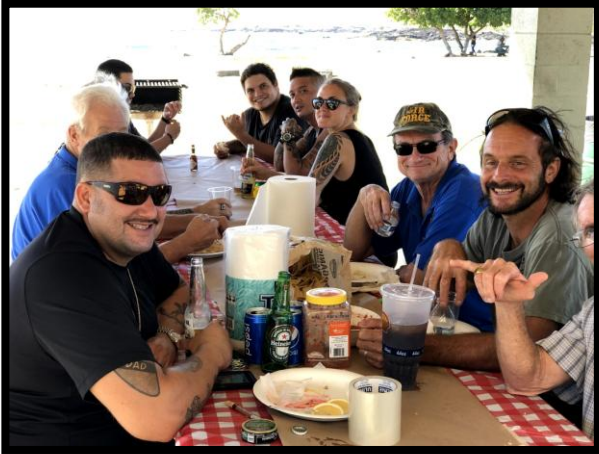
Smiling faces at the 2019 Installation of Officers Picnic at the Old Kona Airport. Above and Below