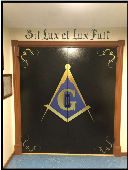
This is the new entrance to the Lodge Room.

“Let there be light and there was Light!”